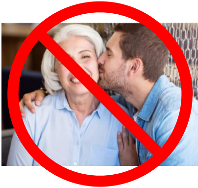
Is close in age