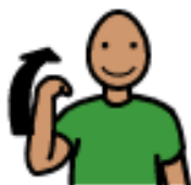
Things that happened in the past