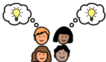
Other people's thoughts