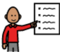
Some rules at work, school, or home