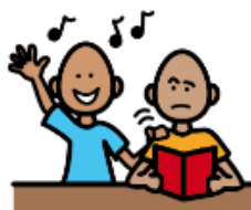
Other people's actions