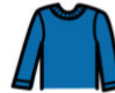
long sleeve shirt